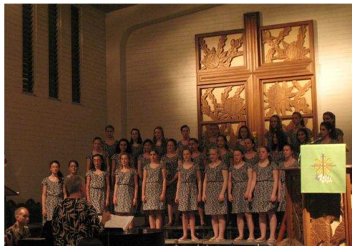
Vivace Girl Choir performed at Our Redeemer on June 30. The choir performed both sacred and popular music.

boxes and cans. Looking at the items in the markets, it is amazing how many different kinds of meals are offered today.