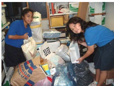
The 4th Graders helping with the donated items to Kamaile Elementary School

From the School's PTO: The PTO had their first Fundraiser of the year. Students and their families sold McDONALDS Ronald McDonald House Charities McFUN-RAISER COUPON BOOKLETS. The fundraiser sale ran from October 27, 2009 – November 23 rd , 2009.